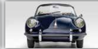
1964 Porsche 356C Carrera 2000 GS Cabriolet: Bali Blue/Black.