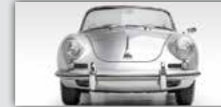
1962 Porsche 356B Cabriolet: Silver/Red.