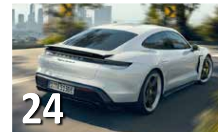
Technical Miracle of the Porsche Taycan

Cover: Rob Alen Porsche Museum workshop, Stuttgart.