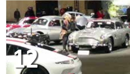
Porsches in Paris