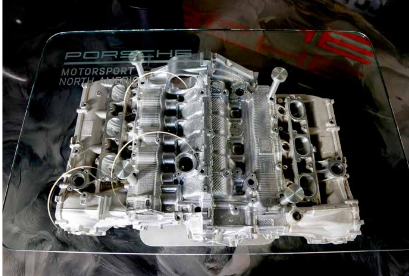
The engine for the GT3 table ran competitively for 2-years in the IMSA series.