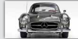
1955 Mercedes Benz 300SL Gullwing: Anthracite Metallic/Red Wine, History, Rudge wheels,