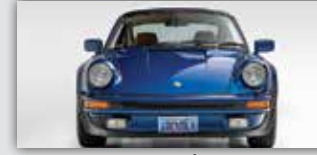
1978 Porsche 930: Bahama Blue/Tan, 2 owners.