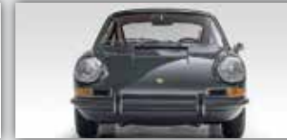
1967 Porsche 911S Coupe: Slate Grey/Red, Complete restoration.