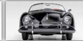
1956 Porsche 356A 1500GS Carrera Speedster: Black/Red.