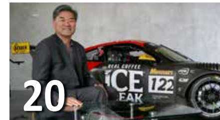
The Complete Porsche Enthusiast