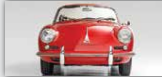
1962 Porsche 356B Cabriolet: Red/Black – Matching #s.