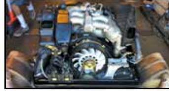
• Rebuilt engines 356-996