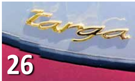
Porsche 935 Wins. Again