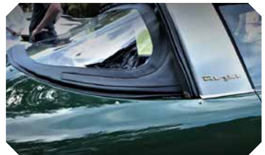
Early Targas came with a fold-down plastic rear window.

The style is over a half-a-century old and is still modern.