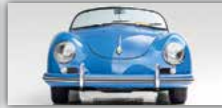
1956 Porsche 356A T1 Speedster: Speedster Blue/Tan.