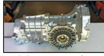
• Rebuilt transmissions 356 / 901 / 915 / 930 / 950

We can rebuild your motor or transmission to factory specs.