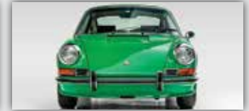
1973 Porsche 911T Coupe: Viper Green/Black, Original paint.