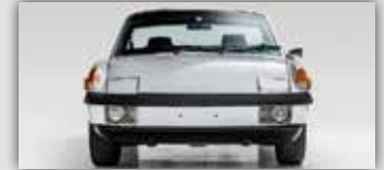
1970 Porsche 914-6: Silver/Black, Several available.