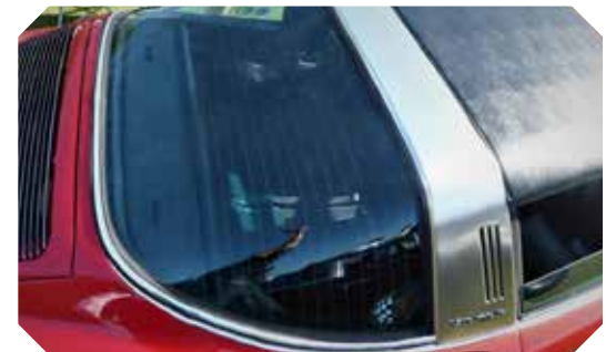
Beginning in 1967, the Targa model could be ordered with a fixed, heated rear window of safety glass.