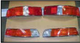
• 1965-68 911 912 light assemblies reconditioned front and rears with new lenses