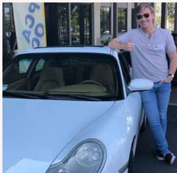
Henry McArdle / 1999 Carrera 4 Glacier White