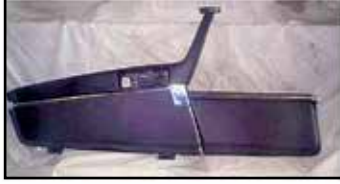
• Door pockets front and rear with door pulls

NEW and USED Porsche Parts • Minor Tune-Ups to Complete Restoration