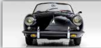
1962 Porsche 356B T6 Twin Grill Roadster: Slate Grey/Red.