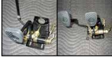
• Reconditioned pedal assembly 1965-1983