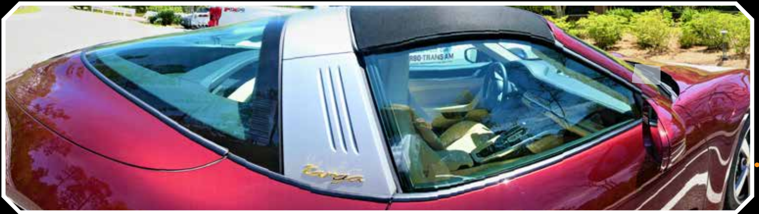
Porsche 911 Targa Heritage.