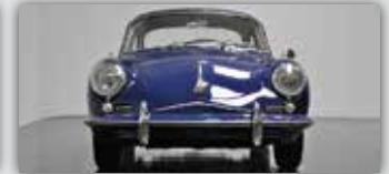
1965 Porsche 356SC Coupe: Bali Blue/Tan, Matching #s.