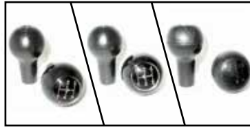
• New 911 912 shift knobs 901 and 915 and 930 shift knob