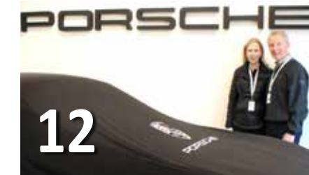
12 Experience the Experience