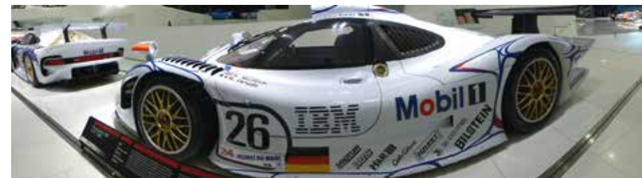
Porsche GT1-98 at the The Porsche Museum, Stuttgart

#26 While not as famous as on a Hollywood star's car or popular racing team, "26" represents Porsche's 1998 24-Hours of Le Mans win. On the side of the GT1-98, it finished first at Le Mans, "#25" was second. It went against Mercedes-Benz' CLK LM, BMW V-12 LMR, Toyota GT-One, Nissan R390 GT1. It was Porsche's 16th Le Mans win celebrating the company's 50th anniversary. It represents a new generation of racing.