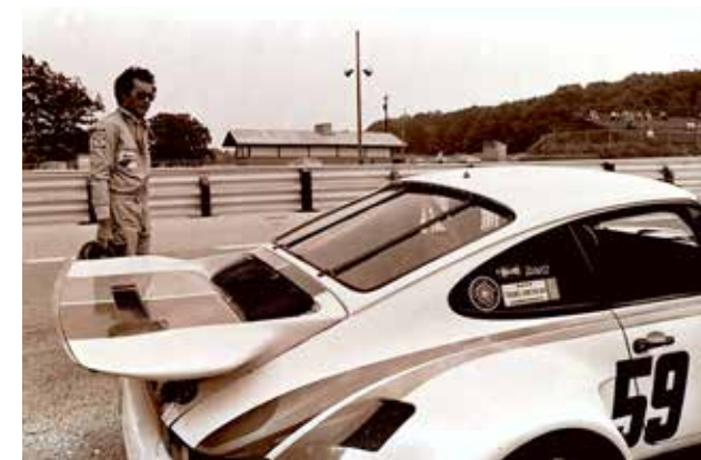
Peter Gregg at Road America, 1970s