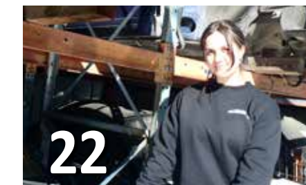
22 Back to Life