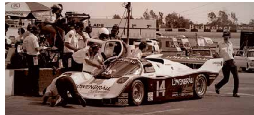
Riverside pit lane

#26 While not as famous as on a Hollywood star's car or popular racing team, "26" represents Porsche's 1998 24-Hours of Le Mans win. On the side of the GT1-98, it finished first at Le Mans, "#25" was second. It went against Mercedes-Benz' CLK LM, BMW V-12 LMR, Toyota GT-One, Nissan R390 GT1. It was Porsche's 16th Le Mans win celebrating the company's 50th anniversary. It represents a new generation of racing.