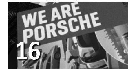
16 Leaving Soon