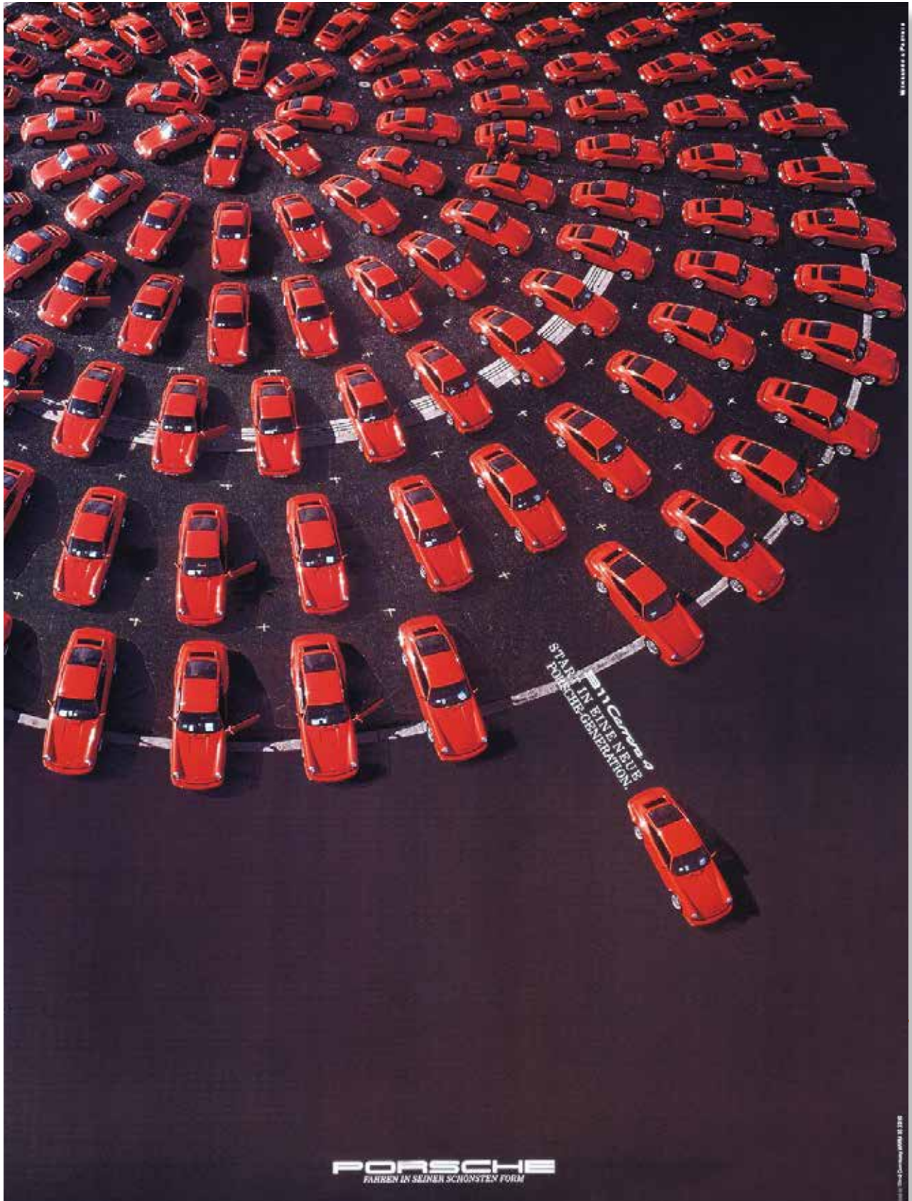
A Bouquet of Red Porsches.