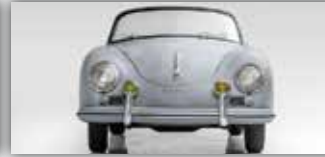
1956 Porsche 356A Carrera 1500 GS Cabriolet: Project.