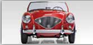
1956 Austin Healey 100 M BN2 Le Mans: Red/Black.