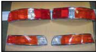
• 1965-68 911 912 light assemblies reconditioned front and rears with new lenses