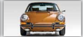
1972 Porsche 911T MFI Coupe: