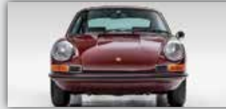
1970 Porsche 911S Coupe: Burgundy/Black, matching #s.