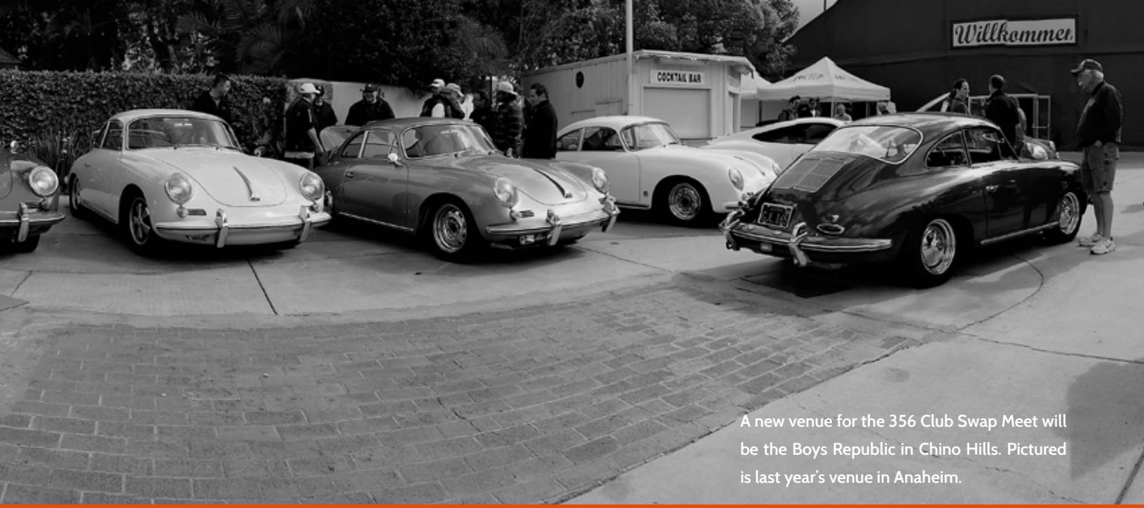
A new venue for the 356 Club Swap Meet will be the Boys Republic in Chino Hills. Pictured is last year's venue in Anaheim.