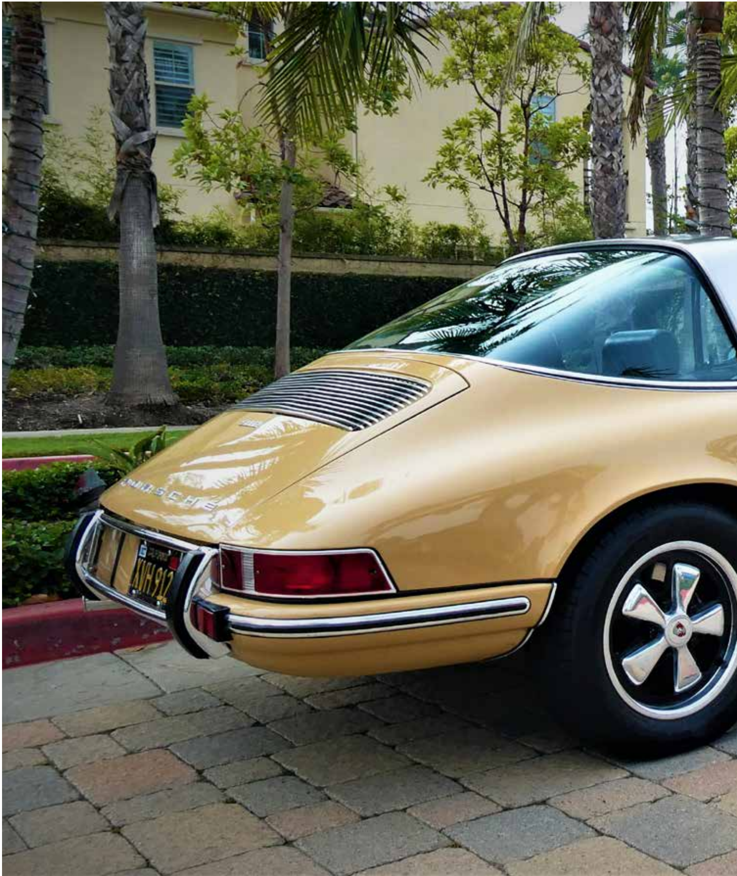
OCR's Ken Fish's 1969 Porsche 912 Targa is a lifetime OC local.