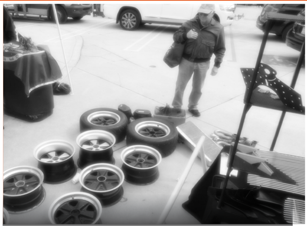
With health circumstances and health protocols, check venues in advance for any possible schedule changes.