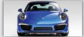
2015 Porsche 911 Carrera Targa 4S: Sapphire Blue Metallic.