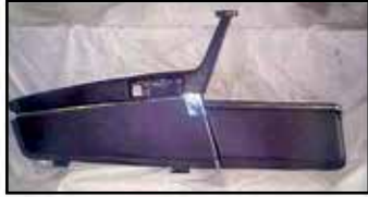
• Door pockets front and rear with door pulls

NEW and USED Porsche Parts • Minor Tune-Ups to Complete Restoration