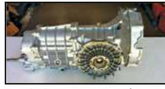
• Rebuilt transmissions 356 / 901 / 915 / 930 / 950

We can rebuild your motor or transmission to factory specs.