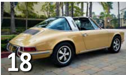
It Must Be Porsche Love