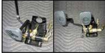
• Reconditioned pedal assembly 1965-1983