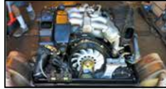
• Rebuilt engines 356-996