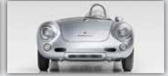
1955 Porsche 550 Spyder: 13k km, known history since day one.