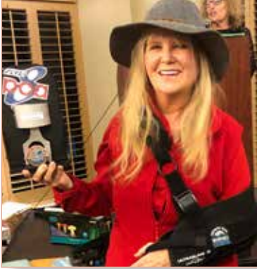
Accepting the OCR Zone 8 Region of the Year Award for 2021.